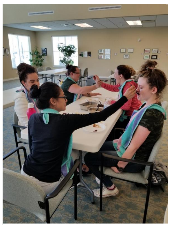
Nursing Assistant students in their classroom setting, learning proper feeding techniques.