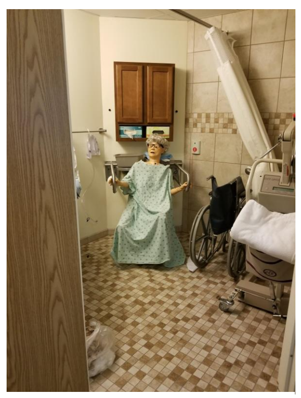
Class-named resident mannequin, Bobby Brown, ready for the students to learn proper toileting procedures.